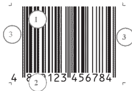
Figure 2 – Key mandatory elements of the bar code mark GTIN-13:

1 – number of information and service marks of the bar code;